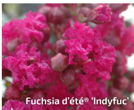
Fuchsia d'été® 'Indyfuc'