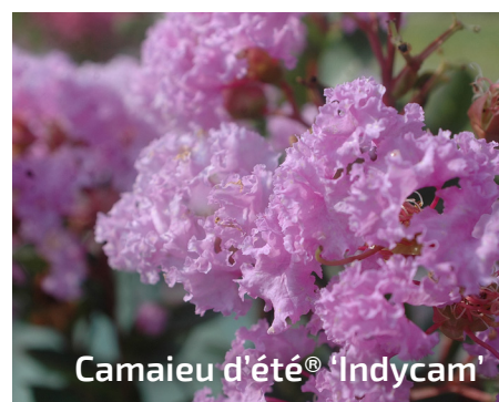
Camaieu d'été® 'Indycam'