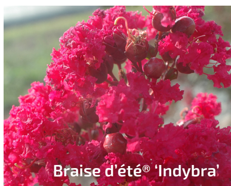
Braise d'été® 'Indybra'

Horticulturalists Christian Gaurrat and Antoine Scrive based in Southwest France have always grown Lagerstroemia in their nurseries as it is a very common plant in this area. Each grower fell rapidly in love with this very exceptional plant. They started their own massal selection in the 90's: collecting seeds, sowing them and propagating the best ones. But it's only by 2006 that the successful story leading to Indiya Charms® started : 5 new early flowering varieties adapted to North Europe were selected and propagated. They propagated over 40,000 young plants in glasshouse for 2-3 years. These new varieties combine lots of benefits: early-flowering (can start flower in June), light and colorful flowers, compact foliage and resistance to diseases.