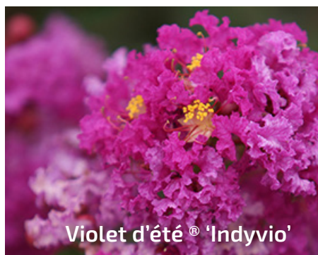
Violet d'été® 'Indyvio'